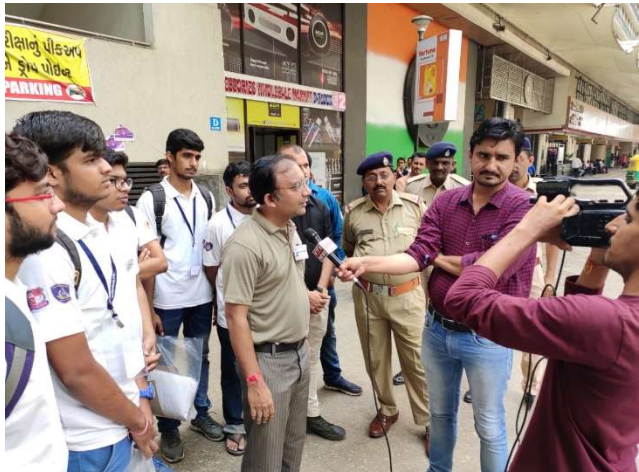
Cyber Safety and Security Awareness at Geeta Mandir Bus Station, Ahmedabad