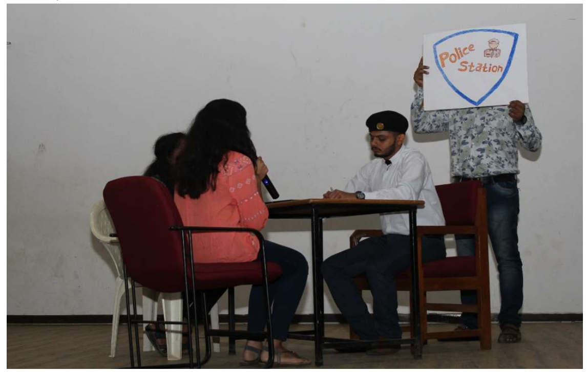
(Skit plays by GTU-GSET, ME- Cyber Security Students)

During this inaugural function more than 800 students were participated for the Cyber Security Awareness Workshop on 24<sup>th</sup> September 2019. The session was taken by Shri. Mahesh Panchal, Dy. Director, GTU.