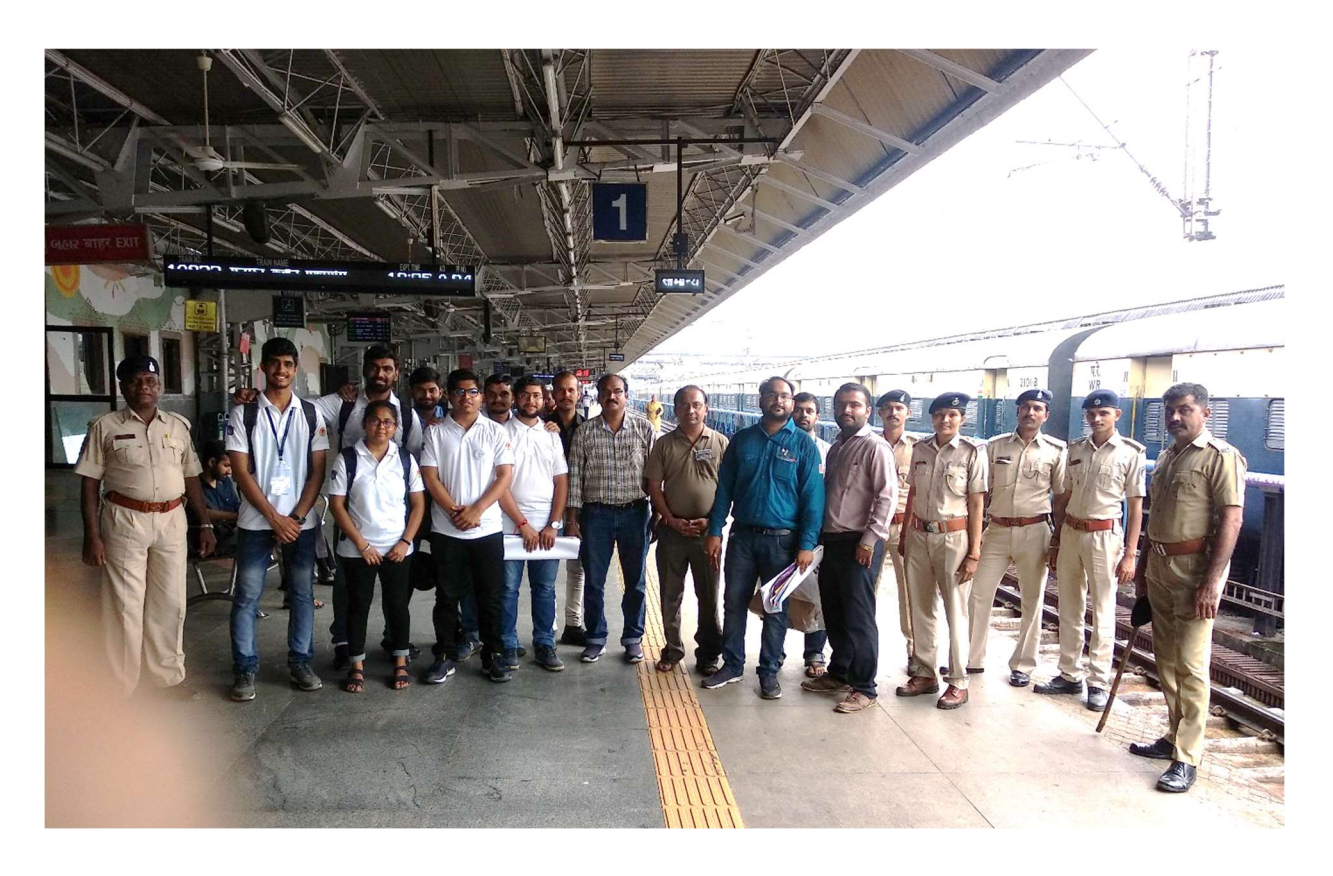
Cyber Safety and Security Awareness at Kalupur Railway Station, Ahmedabad