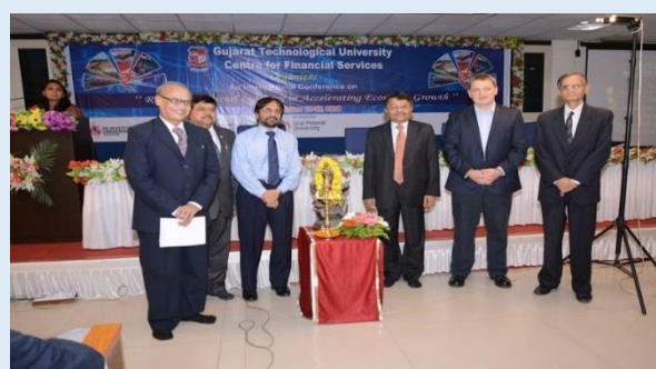
Lamp Lightening Ceremony