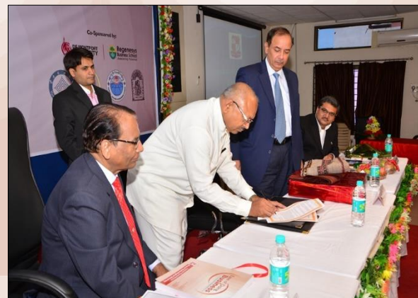
MoU signing ceremony between GTU and CARE