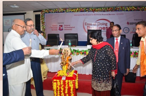
Lamp Lighting Ceremony