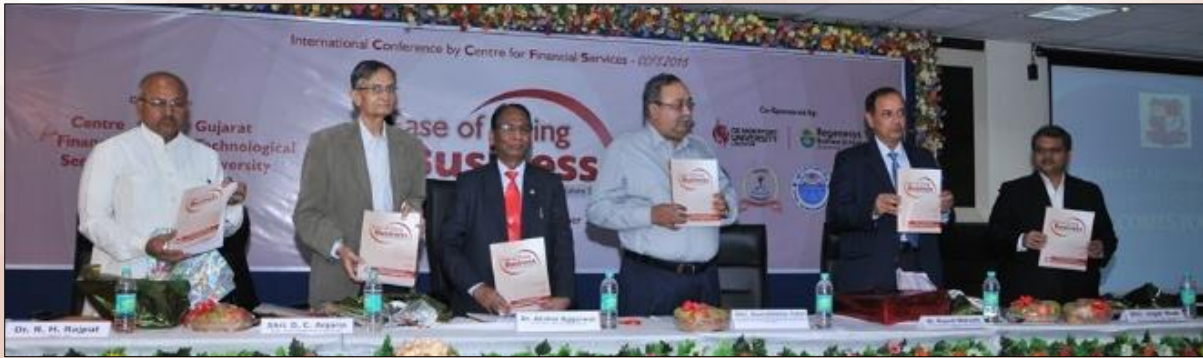
Unveiling of Conference Book