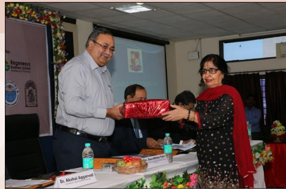
Hon'ble Minister Shri Saurabhbhai Patel and Mrs Shakuntala Aggarwal

Business" Index developed by World Bank and Government of India and how it was made reality by Hon'ble Prime Minister Shri Narendrabhai Modi. Gujarat's No 1 position in EoDB Index of the Indian State reflects the initiatives taken up by the states in the past.