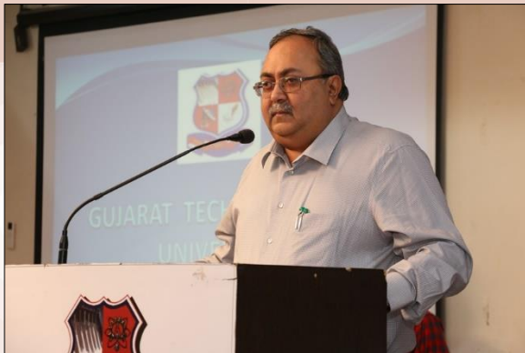
Hon'ble Minister Shri Saurabhbhai Patel while addressing the audience