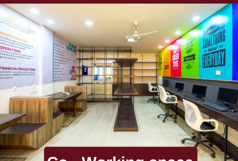
Co - Working space