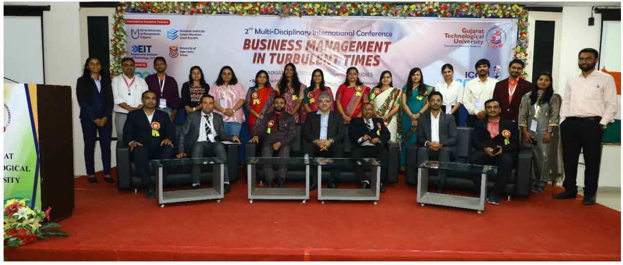
GTU ICON 2022 Presentators with Organizing Committee and Experts