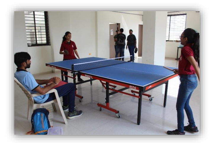
Table Tennis help to focus on your goal. Many students participated in this game and performed