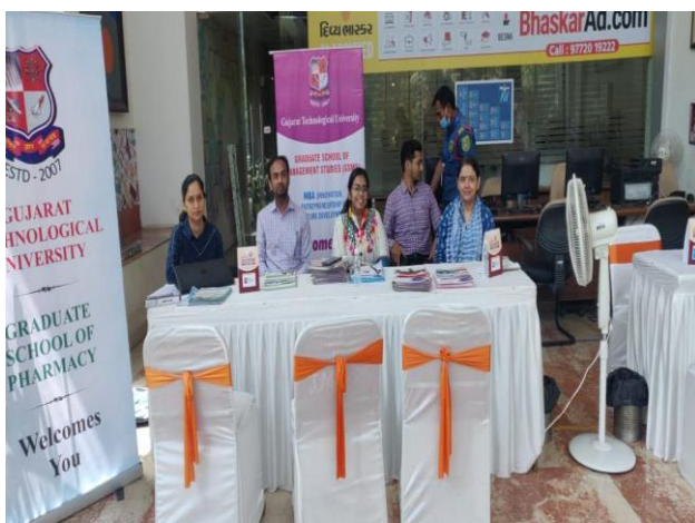
Participation of GSMS at Education Expo organized by Divya Bhaskar at Rajkot