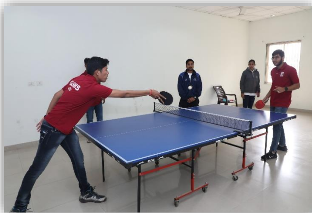
Table Tennis help to focus on your goal. Many students participated in this game and performed