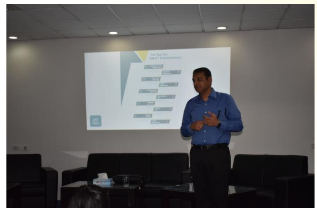
Representing GTU by GSMS faculty member at National STEM summit at New Delhi