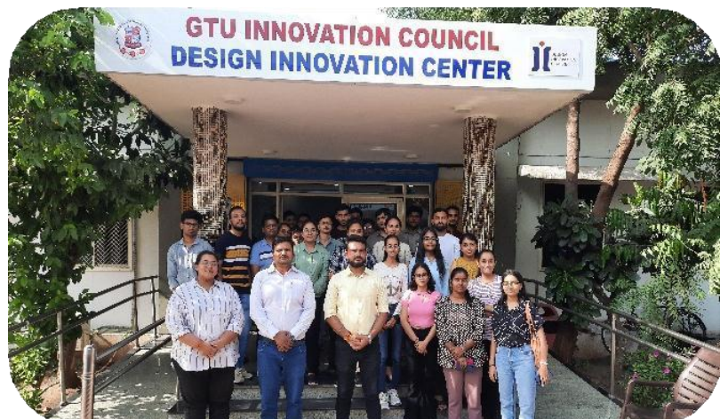
GTU Innovation Council