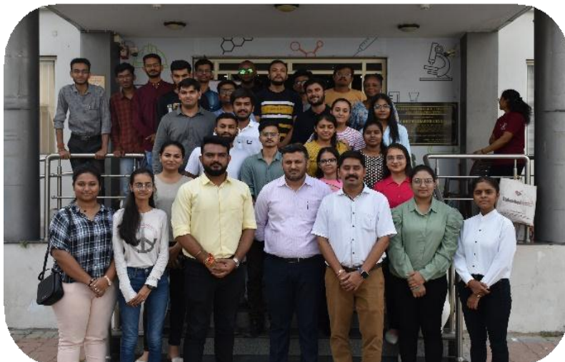
ATAL Incubation Centre