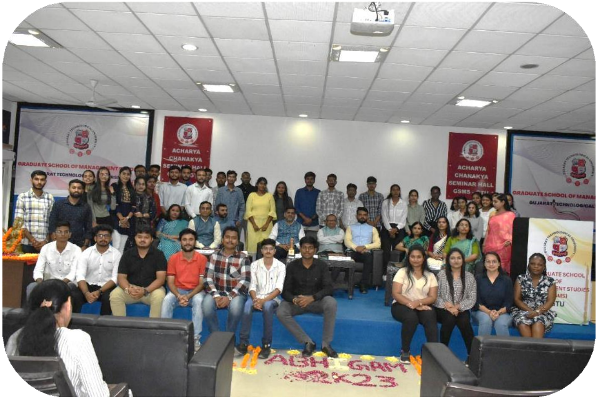
MBA Students (Batch 2023-2025), GSMS, GTU

Overall, it was an informative, interactive, and enjoyable three days orientation program for our new students to welcome them to the GSMS – GTU family.